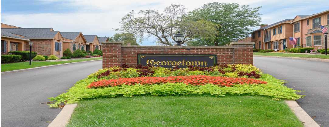
Visit the Georgetown Commons HOA Website: http://georgetowncommonshoa.com/